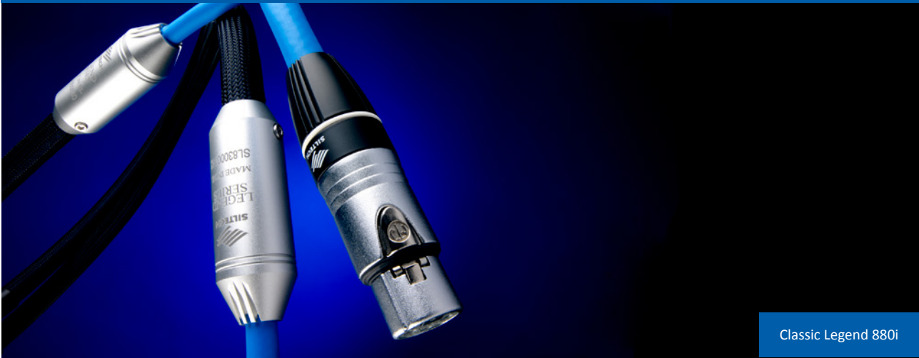
Classic Legend 880i

The famous Siltech Classic Series has a history of almost 25 years: ultra-silent cables with exceptional sound quality, using Siltech's proprietary pure silver-gold alloy conductors. After the Classic, Classic MkII, and Classic Anniversary series, a new edition is ready to prosper: The Siltech Classic Legend Series.