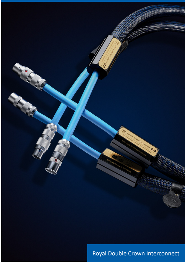
Royal Double Crown Interconnect

Crowning Siltech's world of almost 40 years of ongoing research and development, our engineers succeeded in delivering performance approaching that of Siltech's flagship Royal Triple Crown series but at a more accessible price. The successor to the iconic, much-loved, and multiple award-winning Royal Signature Series, the Royal Crown series has a highly translucent sound that's startlingly open, direct, and engaging.